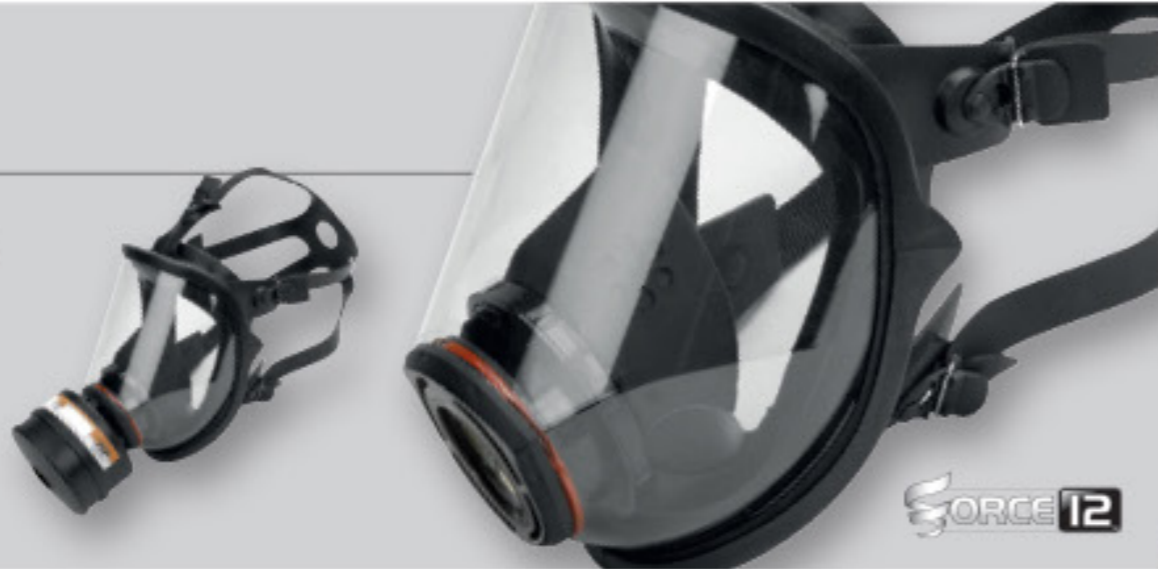
BPJ000-011-000 Force12™ full face mask without DIN canister