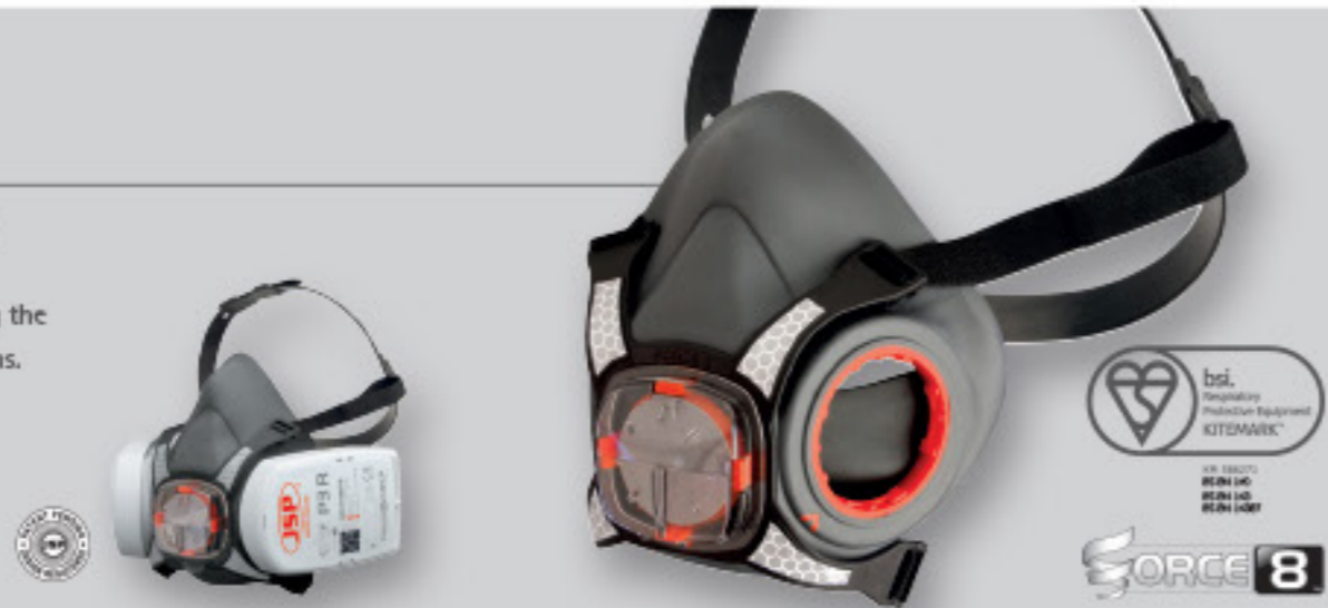
BHT003-015-000 Force8™ half mask - Boxed without twin filters