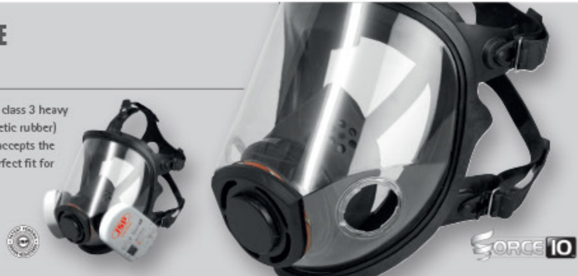
BPK000-011-000 Force10™ full-face mask - Boxed without twin filters